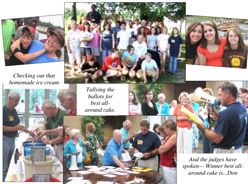
Checking out that homemade ice cream